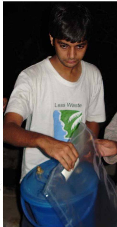
Activist Preparing the Bucket for Sampling (Right)